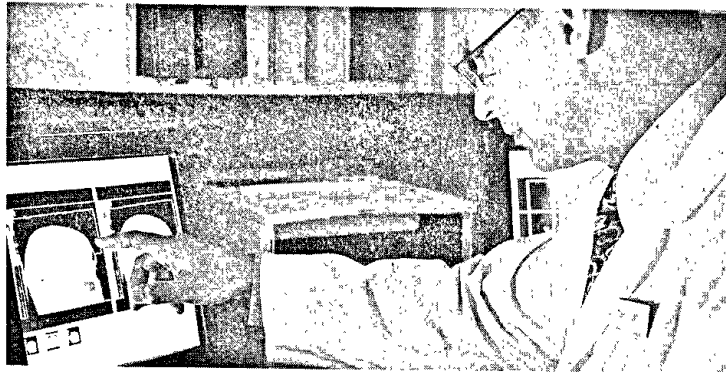
In a study in the Public Library of Science (PLoS) ONE journal, British researchers said their findings suggest it may be possible to design programs to predict which adolescents will go on to have psychiatric problems.

"Combining machine learning and neuroimaging, we have a technique which shows enormous potential to help us identify which adolescents are at true risk of developing anxiety and mood disorders, especially where there is limited clinical or genetic information,"